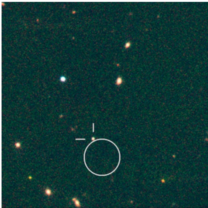
Fig. 1. Three colour-composite image based on our NIR bands ( J , H , and K ) obtained with VLT+ISAAC on 5 September. The circle represents the 6'' XRT afterglow error box. The lines show the position of the optical afterglow. The field is 65'' \times 65'' wide. North is up, East is left.

Data reduction was carried out following standard procedures. Aperture photometry was performed using SExtractor (Bertin & Arnouts 1996). Flux calibration was achieved by observing Landolt standard fields ( I band) and against the SDSS ( z band) and 2MASS (NIR bands) surveys.